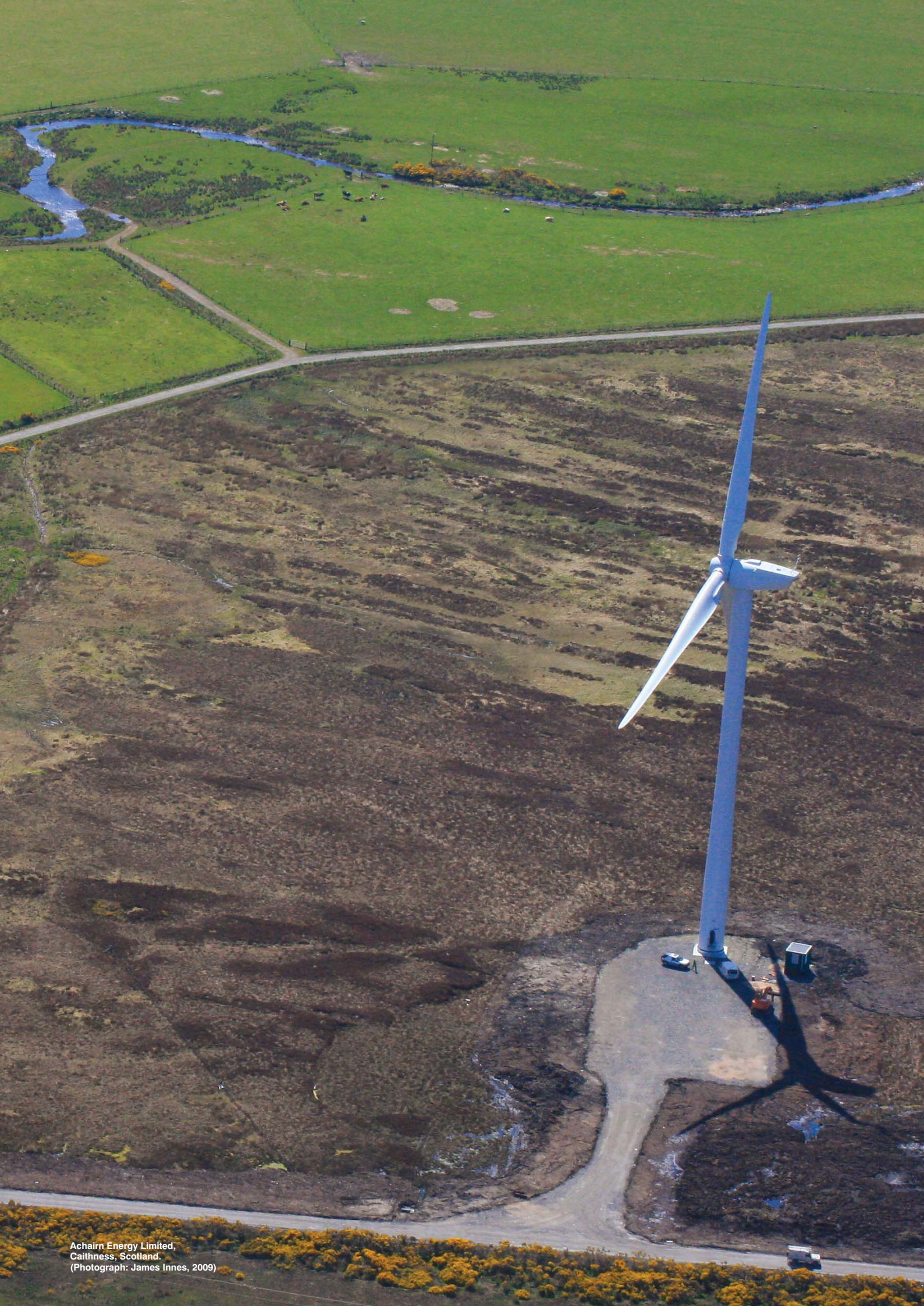
Achairn Energy Limited, Caithness, Scotland.